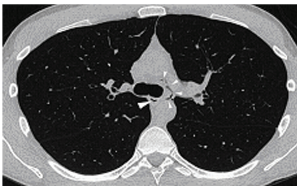
Fig. 1. Axial CT image at TLC shows a small pneumomediastinum; gas is visible adjacent to the left mainstem bronchus, anterior to the aorta, as indicated by small arrows. The large arrow points to the small gas collection normally present in the esophagus.

in Fig 1. This small amount of mediastinal air, probably less than 10 ml, was not visible on chest radiograph. He did not exhibit any signs or report any symptoms, and no other abnormalities were found on the CT scans of his chest.